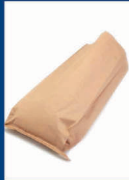
3 Ply Craft Paper Packing