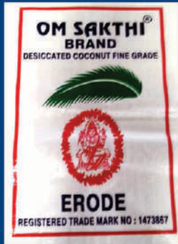
HDPE Inner Linear Poly Bag